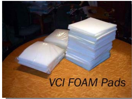
VCI FOAM Pads